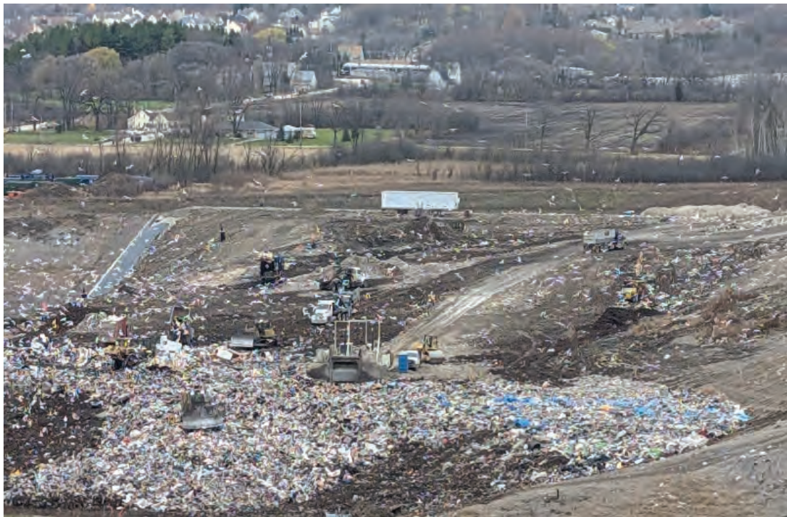
Working face at South end of Phase 3 for most of the month finishing previous and starting new lift. Shaping slopes and corners