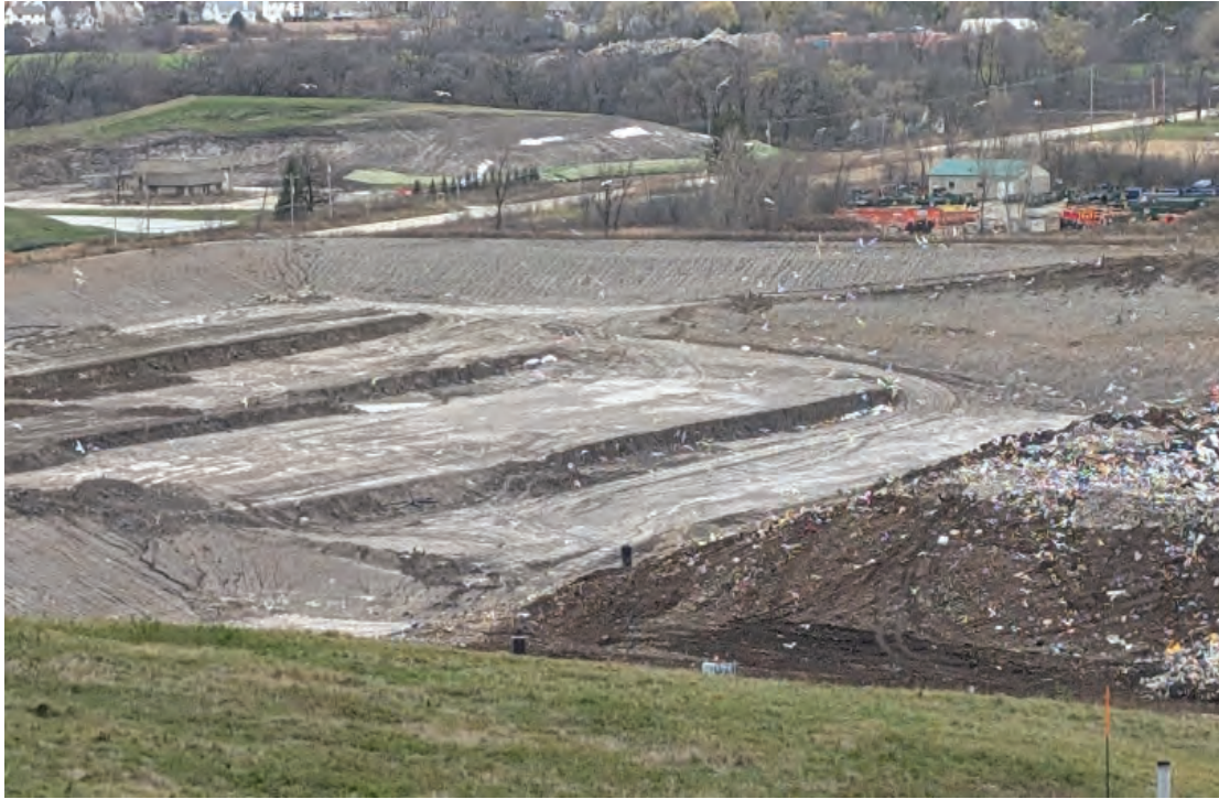
Future cell and covered Southwest corner of Phase 3