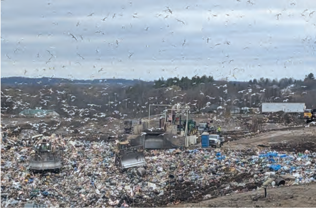
Working face at South end of Phase 3 for most of the month finishing previous and starting new lift. Shaping slopes and corners