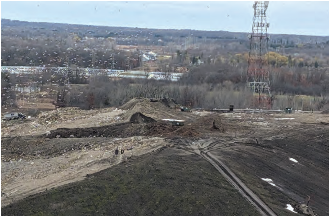
Stockpile soil cover being harvested by excavators and dozers