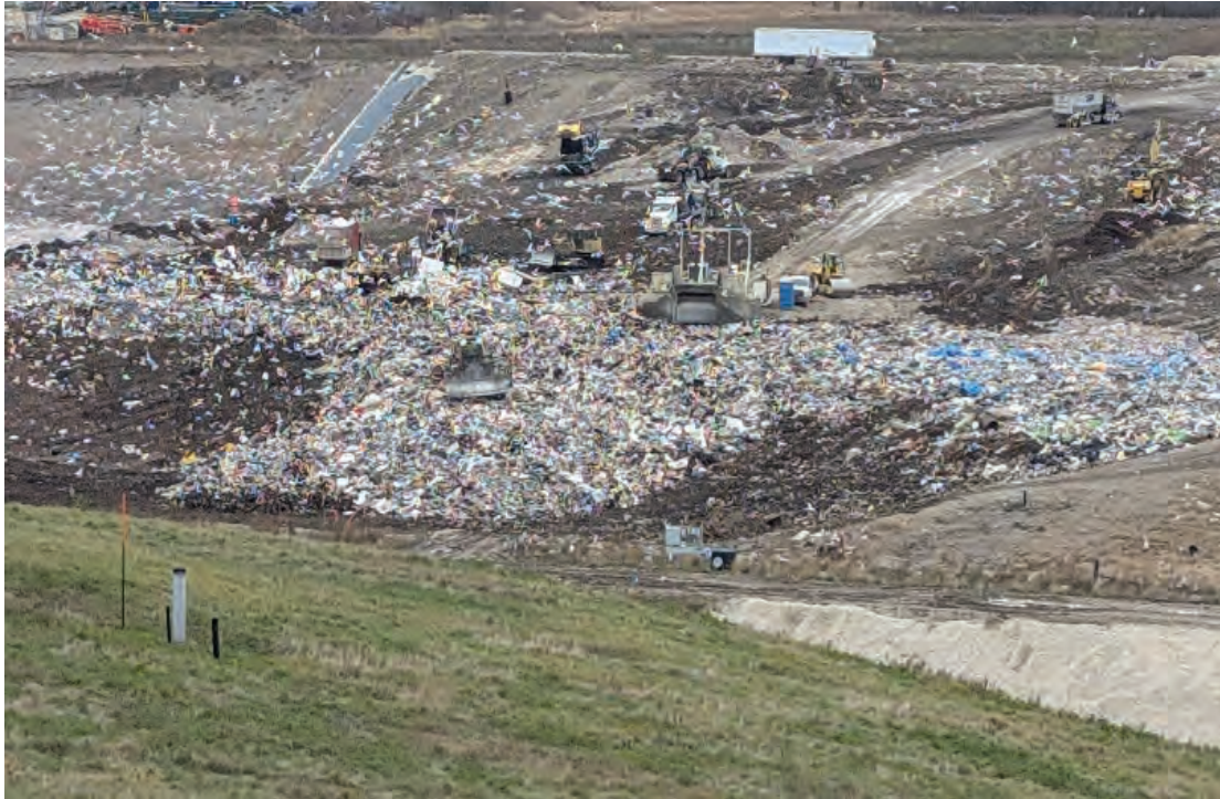
Working face at South end of Phase 3 for most of the month finishing previous and starting new lift. Shaping slopes and corners