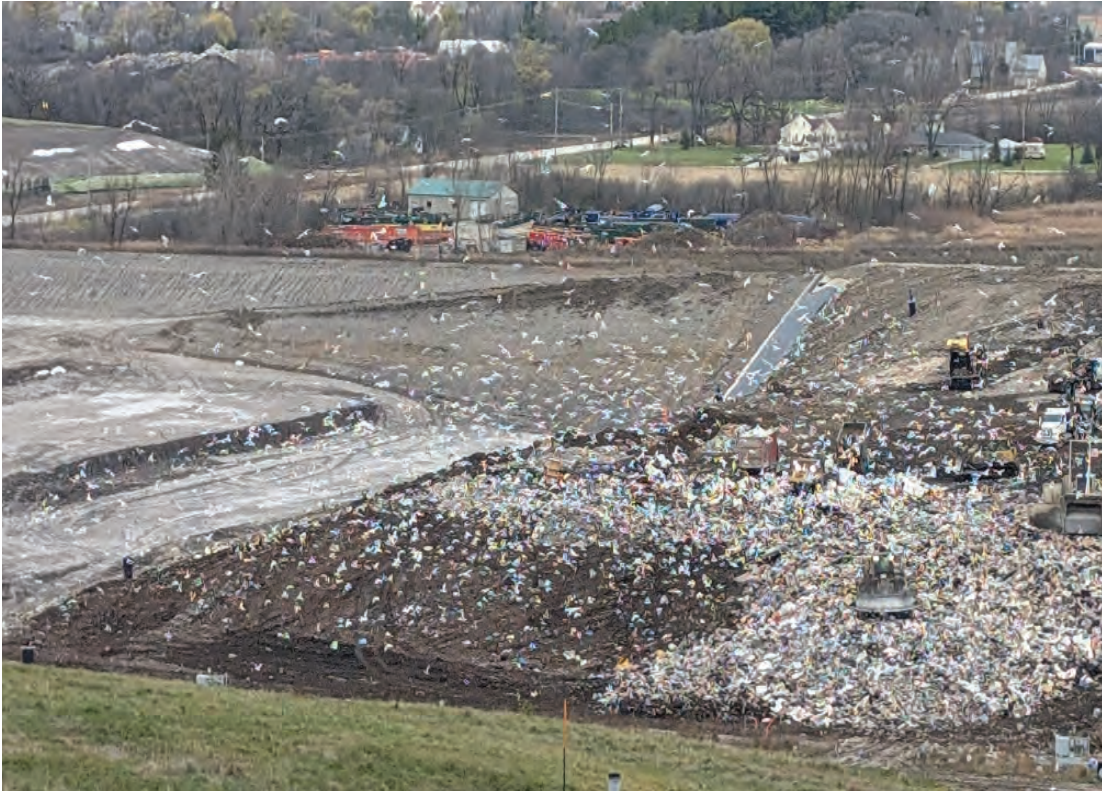
Working face at South end of Phase 3 for most of the month finishing previous and starting new lift. Shaping slopes and corners