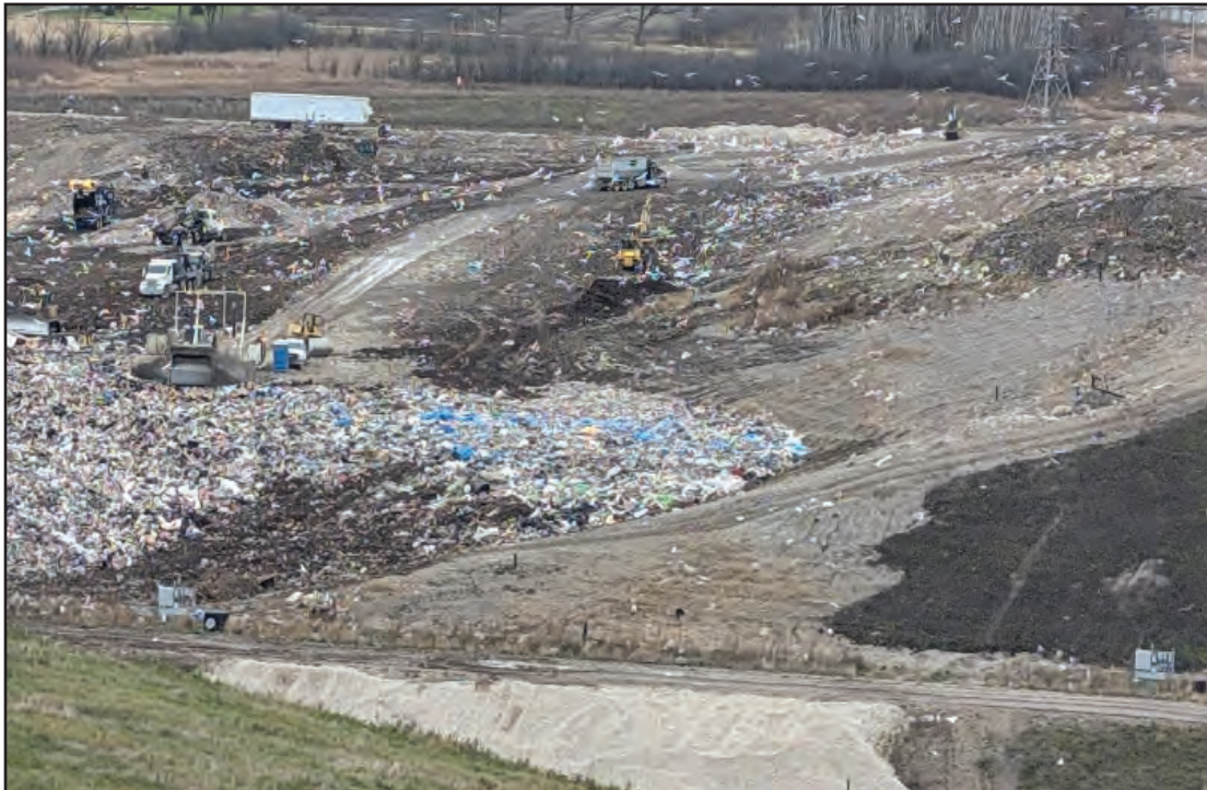
Working face at South end of Phase 3 for most of the month finishing previous and starting new lift. Shaping slopes and corners