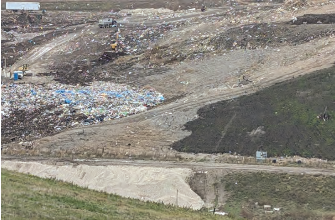
Working face overlaying from Phase 3 into Phase 2 South end